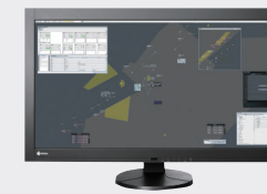
For CAD and high-quality map production