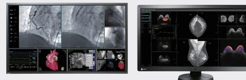
For simultaneous display of diverse medical data