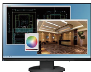
EV2450 and EV2455 feature a frameless design, which allows users to enjoy almost seamless viewing and does not interfere with eye movement between screens, and therefore improves user comfort in a multi-monitor configuration.

We focus on ergonomics-based design so that users can use our products for long hours without experiencing symptoms of stress such as eye fatigue. Thus, we offer comfortable PC environments in various locations such as offices, schools and homes.