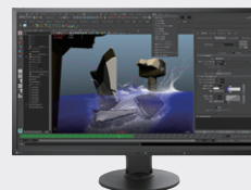
For CAD, finance and business