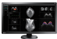
Multi-modality monitor Monitor can display different medical images, identify monochrome/color images automatically, and present them with the optimum brightness and gradation.