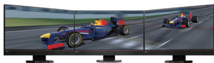
Multi-modality monitor Monitor can display different medical images, identify monochrome/color images automatically, and present them with the optimum brightness and gradation.

Our products contribute to enriching customers' recreation time and daily lives by displaying dark scenes of games, video and animation in vivid detail, raising the enjoyment and comfort of entertainment options.