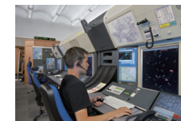
Air traffic control: operations in the control room

One of our major industrial product areas is security and surveillance market. We contribute to enhancing public safety by supporting the stable operation of security systems, using highly reliable monitors that feature excellent visibility and 24-hour continuous operation. In the air traffic control market, we contribute to our mission of ensuring safety in the sky by providing air traffic control towers and control rooms with products such as high-brightness LCD monitors capable of clearly displaying flight status information under daylight conditions. We also meet the diverse needs of other industries, such as railway and marine transport.