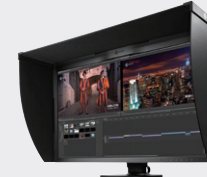
For detailed video editing