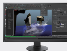
For CAD, finance and business