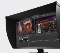
For detailed video editing