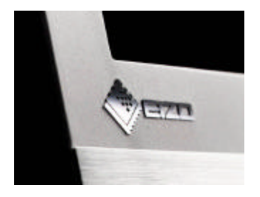
Diamond Cut Processing on Logo Emblem