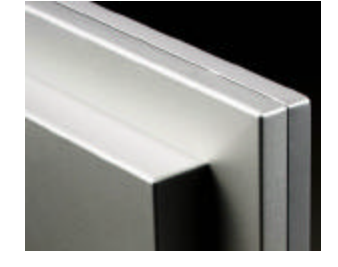
No Ventilation Slots

inserted in an LCD monitor and ventilation slots unnecessary. This results in an overall panel depth of just 52 mm, 6 mm less than the FlexScan L565.