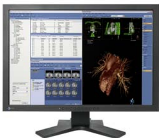
FlexScan MX240W is Penn Health’s monitor of choice.