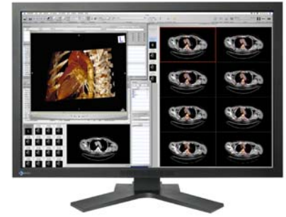
FlexScan SX3031W is AltaPACS' monitor of choice.

tended to take a lot of desktop space and required multiple monitor configurations on their desks. Once the radiologists started installing the SX3031W into their environments, they realized how versatile these monitors were. They could not only do their everyday tasks, but the imaging was so good they could clearly read MR and ultrasounds. This new monitor was compact enough to allow them to view a majority of their applications in one workspace.